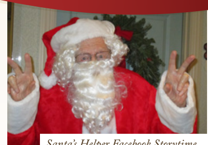
Santa's Helper Facebook Storytime