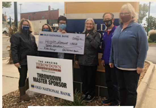
Snapshots of our guests enjoying the Amazing Throwdown Road Rally.