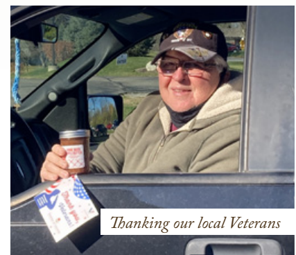
Thanking our local Veterans