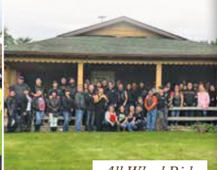
All Wheel Ride