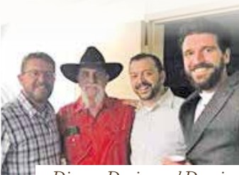
Dinner, Denim and Dancing