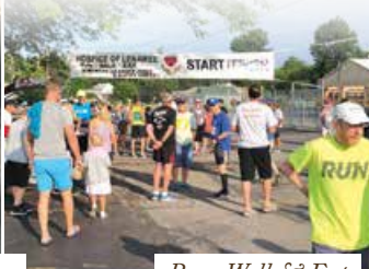
Run, Walk & Eat